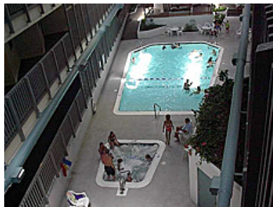
Building B is the 5-story atrium building with center indoor pool